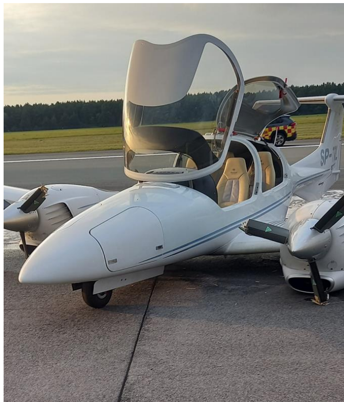
Fig.1. SP-TRL airplane at EMPO after hard landing on RWY26 3

As part of the exercise, 9 take-offs and landings were performed uneventfully. After completing the 9th flight, the crew stopped the plane on the runway and, after a short break, took-off again. During the climb, at an altitude of approximately 500 ft 1 , the pilot-instructor reduced the power of both engines to idle, simulating the powerplant failure. In order to maintain the airspeed, the flight crew started descending with the intention of straight-in landing 2 . The descent was performed with a significant nose down pitch, which caused the plane touchdown with high speed at around 16:05 hrs UTC. As a result the three-wheel landing gear and both three-blade propellers were destroyed and the fuselage was substantially damaged.