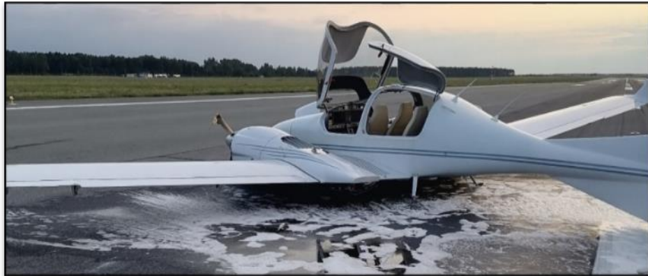
Fig. 10 Accident airplane after it came to rest and was left by the crew [source: PKBWL]

On 19 August 2021, during the accident site inspection, PKBWL found that after the collision with the runway surface, the plane moved to a distance of 268 meters from the touchdown place. The damaged parts of airframe, engine and landing gear were scattered along the length of 336 meters. The plane touched down in the middle of the RWY 26 along its centre line and came to rest with a deviation of about 45° from the runway centre line towards the airport terminal (Fig. 10).