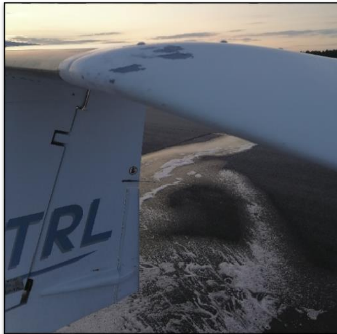
Fig.7. Damaged empennage

Numerous parts (sleeves, bolts, covering elements), mainly from the damaged nose landing gear and damaged fuselage and wing structures, were found scattered near the wreckage.