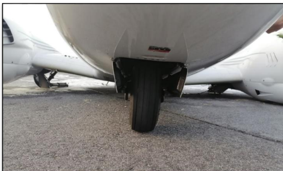
Fig.3. Nose landing gear damaged