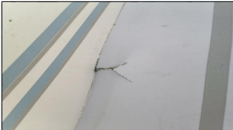
Fig.6. Damaged airframe in the wing connection area.

The wings did not detach from the fuselage, but were slightly damaged in many places. Cracks and delamination of the wings structures occurred especially at their roots.