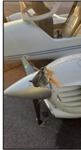
Fig. 4 and 5. SP-TRL aircraft with destroyed propellers blades of both engines.

The wings did not detach from the fuselage, but were slightly damaged in many places. Cracks and delamination of the wings structures occurred especially at their roots.