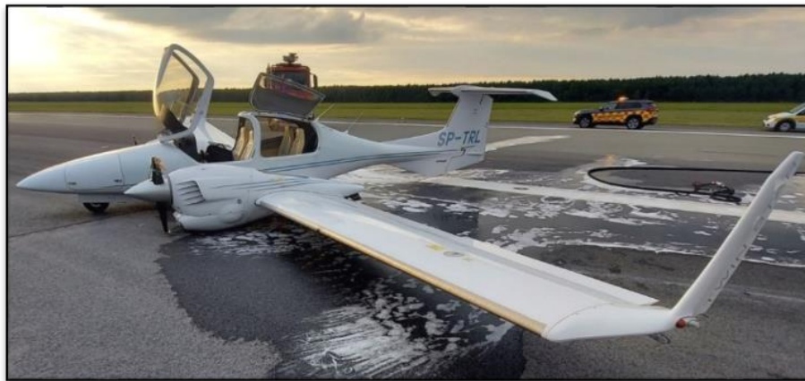
Fig.2. SP-TRL airplane at EPPO after the accident

The plane was substantially damaged. The landing gear of the aircraft was damaged, the main landing gear struts were broken and the wheels detached from their construction. The nose landing gear strut and its wheel were pressed into the nose landing gear well.