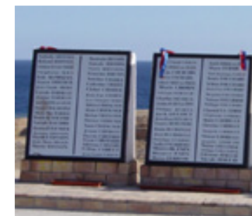
Sharm el-Sheikh accident memorial (January 2004)